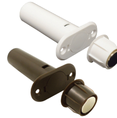
ELK-6023 (White) ELK-6023BR (Brown)