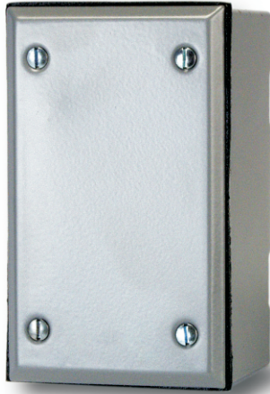
VERIFACT™ E Microphone