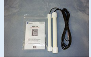
P8000 Directional Probe