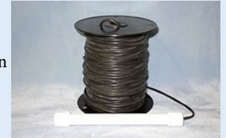
P500 Series Basic Probe