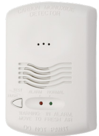
CO1224T Carbon Monoxide Detector