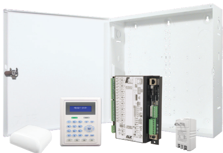
ELK-E27SYS1 Includes E27CB Board, AEKP Keypad, P1426 Power Supply, 73 Speaker, and SWB14 Enclosure