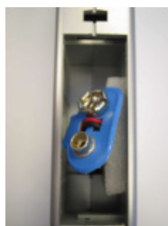
Fig.4. PP3 battery connector