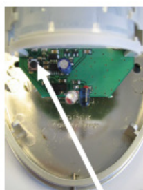
Fig.7. Detector's programming button