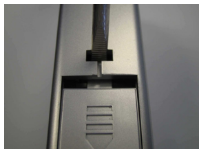
Fig.3. Removing battery compartment cover

Before installation, remove the battery compartment cover (fig. 3 and fig. 4) and insert a 9V battery (PP3). Make sure the on/off switch on the Walk-Tester is set to 'off' while connecting the battery (fig. 5).