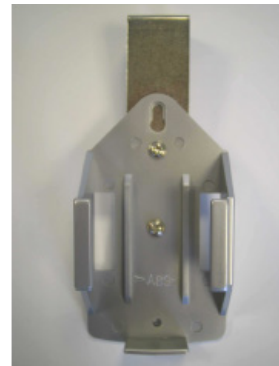
Fig. 2 Walk-Tester holder and bracket