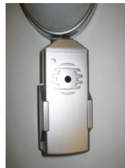
Fig.8 Walk-Tester in holder and fitted to detectors, ready for walk testing

The Walk-Tester will illuminate and sound an alarm every time the detector is activated.