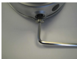
Fig.6. Detector's cover and screw