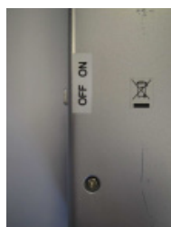
Fig.5. On / Off switch